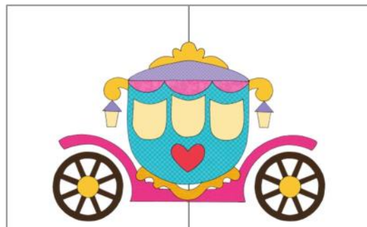
Diagram 1 ▶