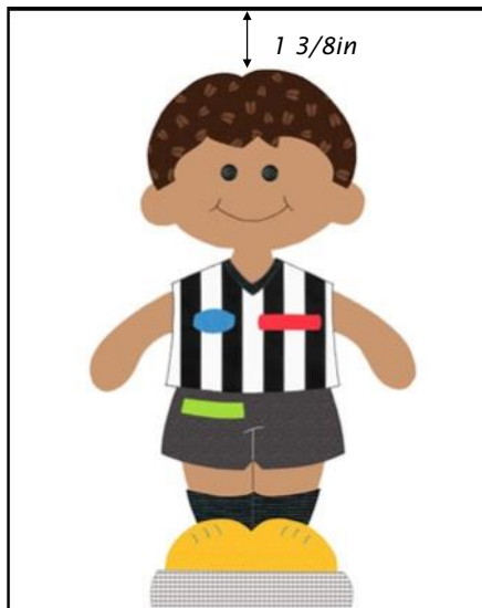
Diagram 1 ▼